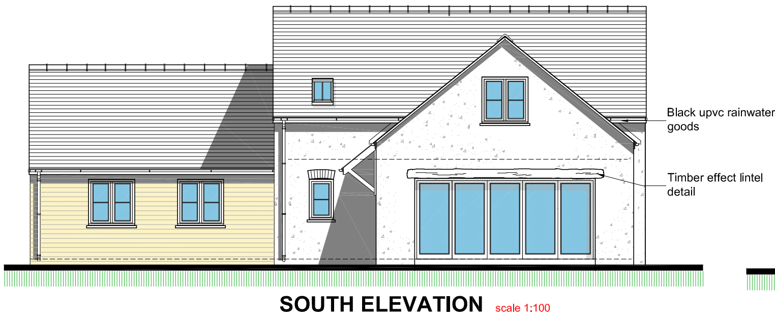
SOUTH ELEVATION scale 1:100