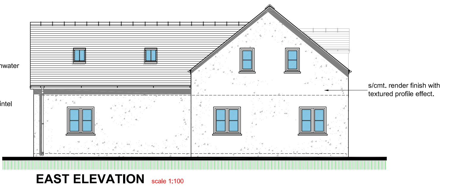
EAST ELEVATION scale 1:100