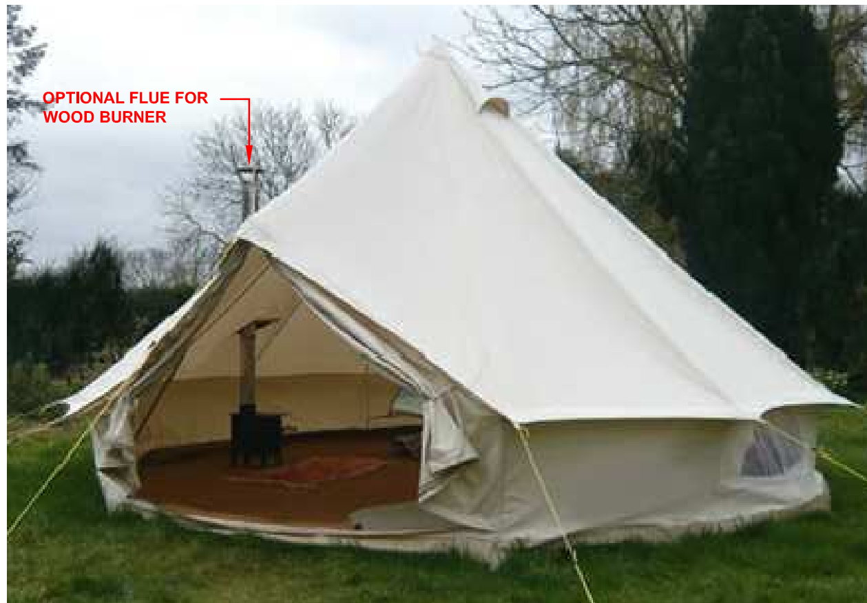
TYPICAL ELEVATION 2