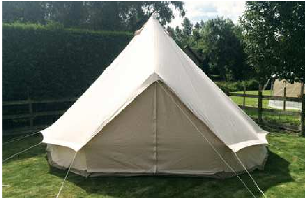
TYPICAL ELEVATION 1